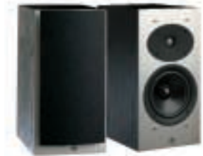
AS-B1 Bookshelf Speakers